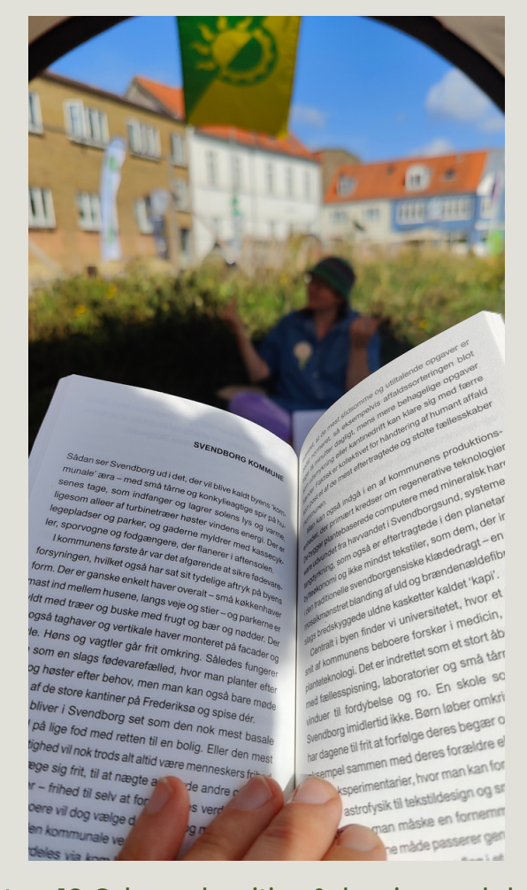
Picture 10. Solarpunk writing & drawing workshop at Klimafolkemødet 2024