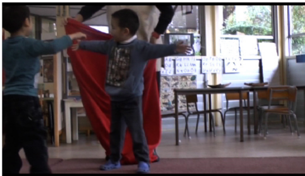
Fig. 1 Fabric tunnels to support imagining