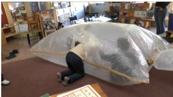
Fig. 2 Setting up and exploring the bubble—being inside a drop of pond water