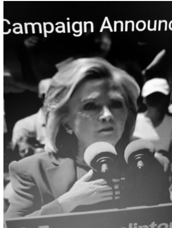
Figure 2: Hillary Clinton

creed) with her own. At this point, Clinton becomes one who speaks from her heart (although she does not stop being a representative of the Democratic Party).